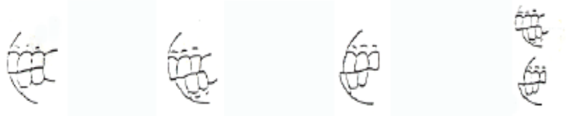
Perfect Bite Teeth Meet evenly Parrot Mouth Over bite 1/4" or less Monkey Mouth Under bite 1/4" or less Parrot or Monkey Mouth In excess of 1/4"

Mouth Defects: If an overbite (top teeth extend out over the bottom teeth) or underbite (bottom teeth extend out beyond the top teeth) exists that extends in excess of 1/4" the donkey should be registered as Pet Quality .